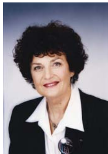
Professor Fiona Stanley Australian of the Year 2003

The Patron and keynote Australian speaker for the OMEP World Congress 2004 opening is the 2003 Australian of the Year, Professor Fiona Stanley. Internationally acclaimed for her work in child health research, Professor Stanley's professional aim is to secure an Australian commitment to improve significantly the health and wellbeing of children and young people.